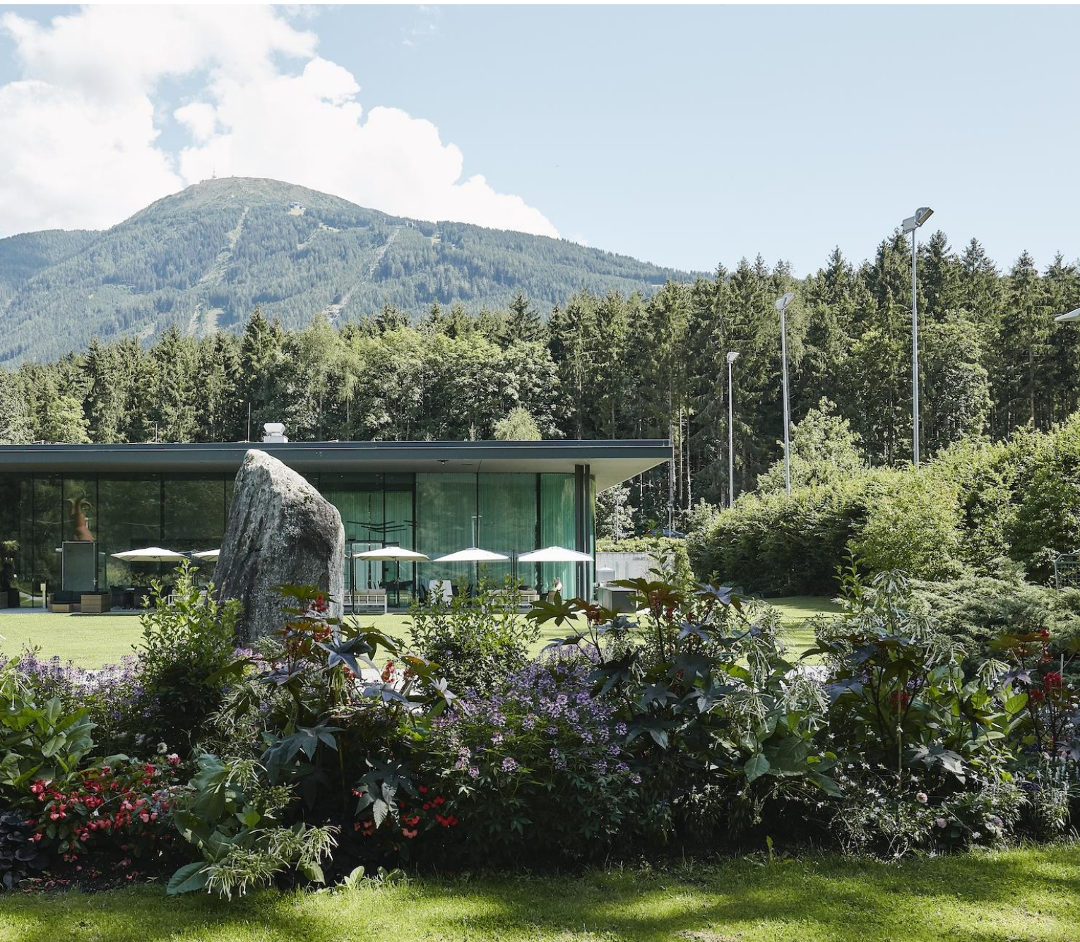
Convention Bureau Tirol