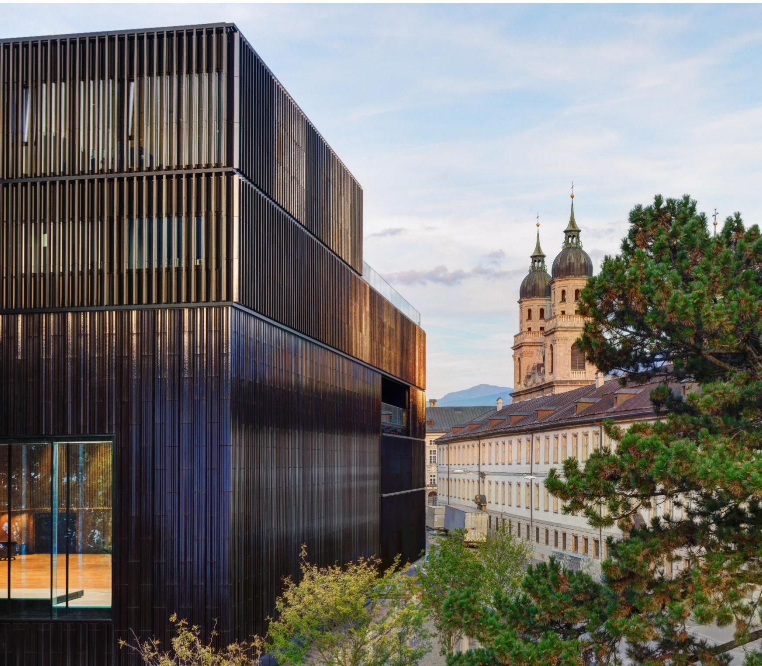
Convention Bureau Tirol